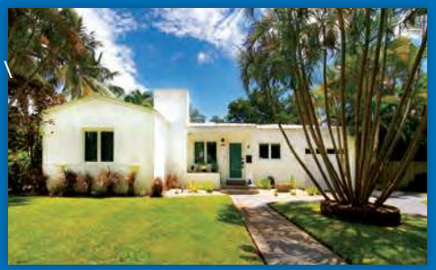
Shores Casa Palmas 6 NW 107th Street. Miami Shores, FL 33168 Offered at $469,000

Live large in this smartly-updated compact 1940's corner lot home with Deco design details and countless upgrades. The wideopen living area is spacious, bright, and perfect for get-togethers. The eat-in open gourmet kitchen boasts sleek white cabinetry, stainless steel appliances, and a Carrera marble top island with gas range. Beautifully-maintained original finishes and upgrades include rich hardwood floors, gorgeous