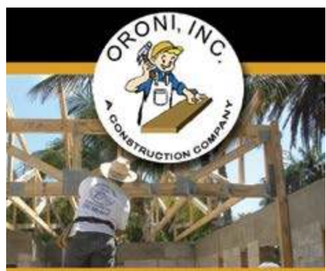
New Construction • Remodeling Residential • Commercial

• MTC has also added MTC Usher Program providing on-the-job training and life skills for college students.