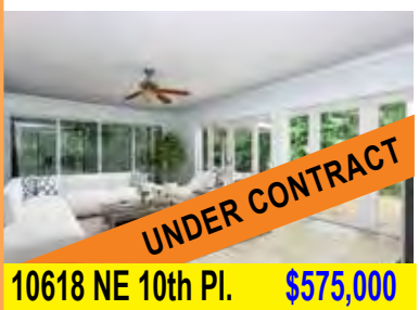
white kitchen, beautiful quartz countertops.

This charming 2 beds/2 baths is the perfect place to call home! Features 2 COVERED PARKING SPACES and spacious split floor plan.