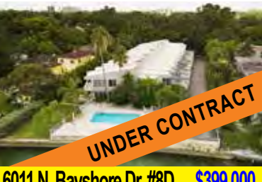
6011 N. Bayshore Dr. #8D $399,000

Morningside's best kept secret and extremely rare to market, this is one of only 12 townhomes located in Morningside's beautiful historic section.