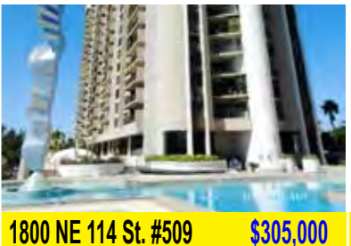
Incredible Value for this large 3BR/2BA open concept Welcome to a huge 2,350 sq. ft. South Rotunda home that's perfect for entertaining w/ a brand new with water views and lots of sunlight! This charming and spacious Rotunda has two balconies.