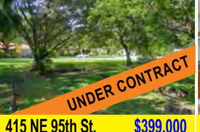
415 NE 95th St.

GREAT TURNKEY OPPORTUNITY! Wellknown full service nail Salon & Spa with repeat customers and great reputation.