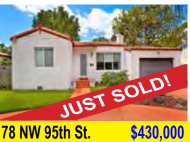
Stunning! Totally remodeled 2/1 charming ranch home in Miami Shores. Original charming Stone fireplace and high vaulted ceilings in the living room.