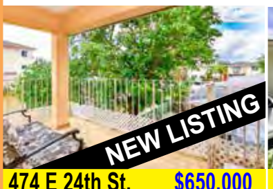
Fourplex has well below market rent with projected Cap Rate of 8%.

Rare 4,000 + sq ft Penthouse in the sky with 14 ft ceilings! This exquisitely remodeled 4BR/2.5BA, SE corner condo is a MASTERPIECE.