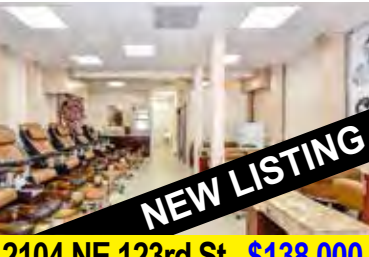
2104 NE 123rd St. $138,000

Morningside's best kept secret and extremely rare to market, this is one of only 12 townhomes located in Morningside's beautiful historic section.