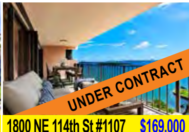
Amazing wide bay views from this 1,460 sg ft 1BR/2BA Cricket Club condo. Huge 30 ft balcony (like a second living room)!

Large multi-family in highly sought after Palm Grove in the Upper Eastside! Entire property gated and fenced.