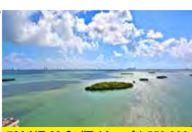
780 NE 69 St #T-1A

Seller offer SELLER FINANCING! Zoned C2 (mixeduse commercial), the property can be turned into a hotel, medical center, or develop a 10 story building.