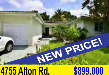
Very rare to market after 20 years, this ENJOY MIAMI BEACH LIVING in this beautifully maintained MIMO style home surrounded by lush tropical landscaping! Gorgeous 3BR/3BA PLUS bonus room.