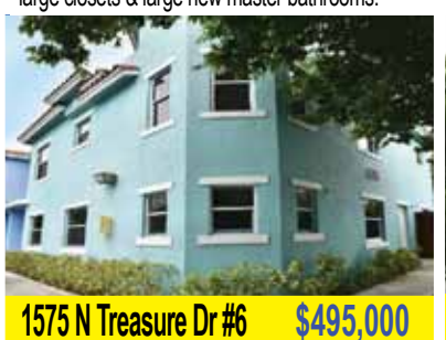
Totally remodeled Treasure Island (North Bay Village) townhome. Rare corner 3BR/2.5BA (+bonus room), patio & yard & 2 parking spots

beautiful 270 degree panoramic views from this SW 2 BR / 2 BA corner unit.