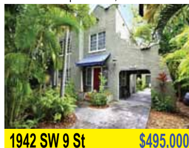
Dripping in charm, this 2,350 sf pre-war Spanish masterpiece sits on a large 7,645 sf lot. Totally remodeled 8 years ago, the main house is 4BR/1.5BA; guest cottage is 1BR/1BA.