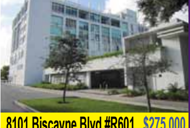
8101 Biscavne Blvd #R601

Exquisite totally remodeled modern Morningside masterpiece! One of gated Morningside's largest homes. 3,205 sf, 4 BR / 4 BA + garage.