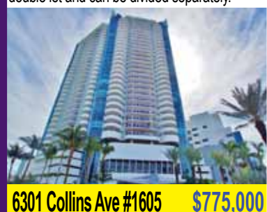
Floor-to-ceiling glass allows you to enjoy

Large 850 sf loft with great views and 14 ft ceilings in The Bank Condo. Zoned to work and live. Rare open kitchen, full bath & more.