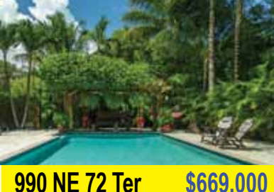
990 NE 72 Ter

Charming 3BR/2BA Morningside home located on a large 13,750 sf double corner lot. This is a double lot and can be divided separately.