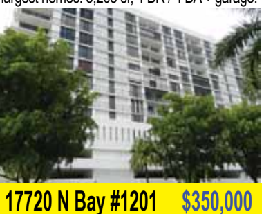
Huge 1,578 sf 2BR/2BA split plan unit w/large screened in balcony. This unit has panoramic views East over the park & the ocean.