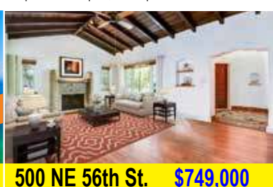
Amazing panoramic ocean views from this Location! Location! This HISTORIC Art Deco one of Morningside's most beautiful corner lots.

2 bedroom PLUS DEN, 2.5 bathroom condo masterpiece is dripping with charm. Located on home in the iconic La Perla condominium.