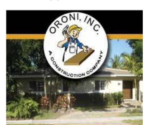
New Construction • Remodeling Residential • Commercial

305.685.0412 www.oroni.com email: info@oroni.com 14040 NW 6th Ct • North Miami, FL 33168