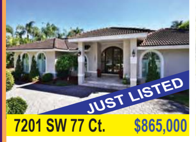
Exquisite & elegant 4BR/3.5 BA home with a spectacular floor planlocated in desirable Sunset neighborhood. lots of natural light.

8611 Arboretum Ln. $800,000 In Miami's Upper East Side sits Casa Bianca, a new private gated community. Carina model: 3BR/3BA, 2,460 sq ft