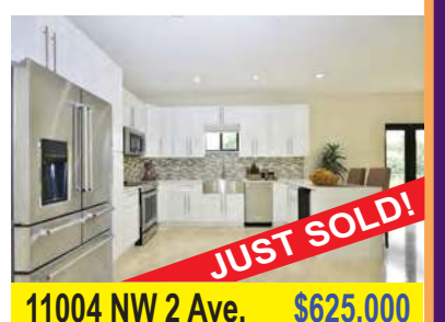
Rare opportunity to live in a newly built 2017, Miami Shores home, This large 2,400 sf 4BR/3BA home has it all.

9180 Byron Ave. $752,180 Beautifully remodeled 4BR/3BA plus den and keeping all the pre-war charm! This gorgeous home has all impact windows and doors.