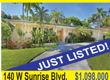
Exquisite 4BR/2BA home in highly desirable South Coral Gables. This 2,577 sq ft home features impact windows & doors.