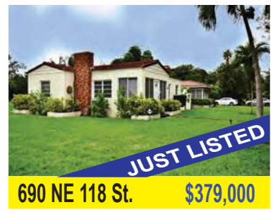
Adorable pre-war charmer located on one of Biscayne Park's loveliest streets. This 2BR/1BA gem is on a large 8,625 sf corner lot.