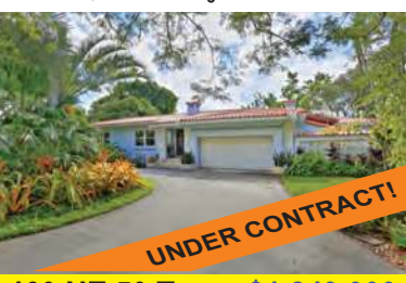
460 NE 50 Ter. $1,249,000

covered carport. This MIMO style home has beautiful polished terrazzo floors, white remodeled kitchen.