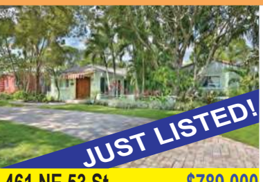
461 NE 53 St.

This gem is a large 3/2 plus a den (4th bedroom), formal dining room plus large dinette/ family room off the remodeled open kitchen.