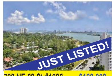
780 NE 69 St #1606

BeautifullyremodeledMIMOgemlocated in gated Morningside. A spacious 3,307 sf, pool home has huge 2 car garage. condo in the popular Palm Bay Yacht Club.