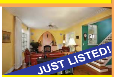
463 NE 55 Ter.

Attention boaters - This exquisitely remodeled 1,917 sf 2/2.5 has amazing panoramic views from every room and includes a private dock !!!