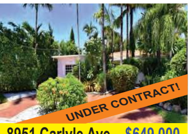
8951 Carlyle Ave.

BREATHTAKING PANORAMIC VIEWS OF THE BAY AND BEACHES from this 1BR/1.5BA