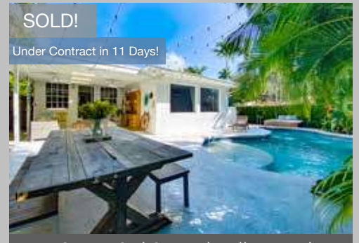
670 NE 73rd Street | Belle Meade Sold at $824,000