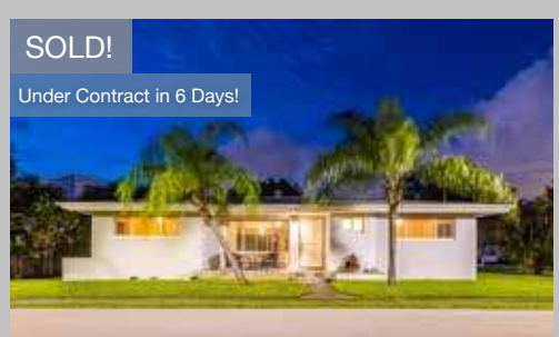
970 NE 87th Street | Shorecrest Sold @ $649,000