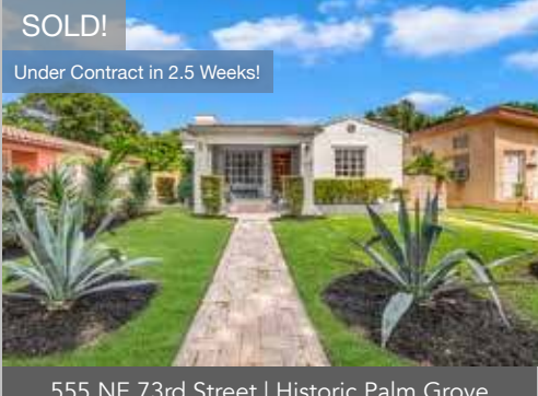
555 NE 73rd Street | Historic Palm Grove Sold @ $570,000