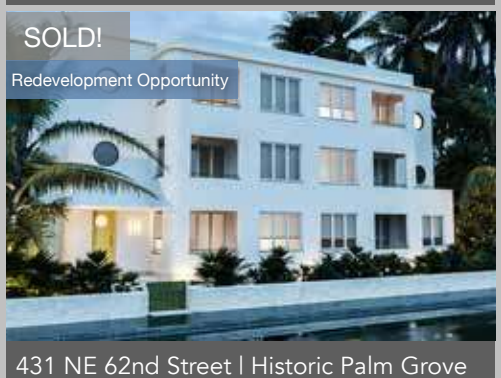
Sold @ $350,000