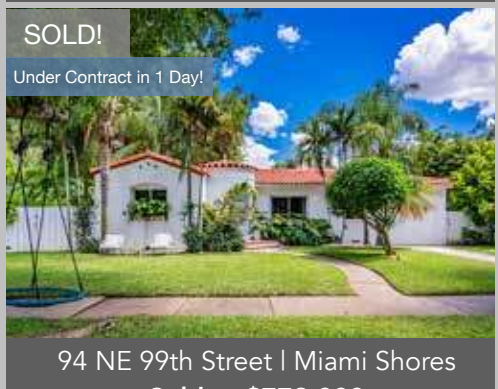
Sold at $779,000