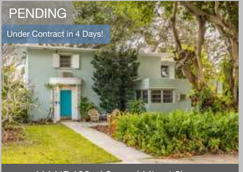
444 NE 102nd Street | Miami Shores Offered @ $659,000