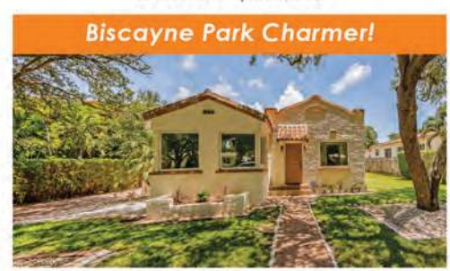
Biscayne Park | 677 NE 120 St. 3 Bedroom 2 Bathroom Offered at $ 425,000

Biscayne Park | 862 NE 111 St. 3 Bedroom 2 Bathroom ( Pool ) Offered at $ 589,000