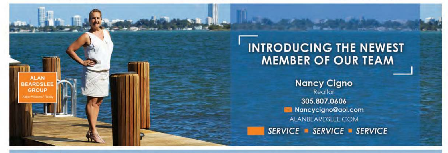
ARE YOU CONSIDERING SELLING YOUR HOME?

Biscayne Park | 620 NE 115 St. 3 Bedroom 2 Bathroom (Pool) Offered at $ 489,000