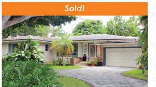
Miami Shores | 1048 NE 99 St. 2 Bedroom 2 Bathroom Offered at $569,000

Miami Shores | 987 NE 96 St. 4 Bedroom 3 Bathroom Offered at $ 775,000