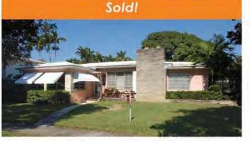
Miami Shores | 1075 NE 96 St. 2 Bedroom 2 Bathroom Offered at $ 599,000