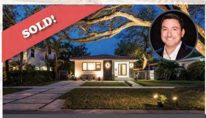
475 NE 91 ST CENTRAL SHORES RECORD BREAKER!