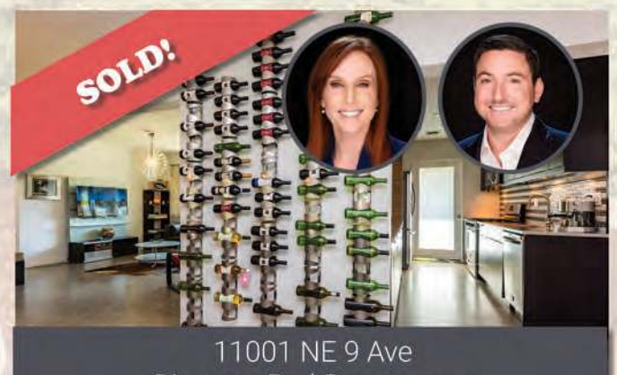
11001 NE 9 Ave BiscayneParkBeauty.com 8 OFFERS IN 24 HOURS!