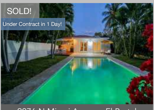
9076 N Miami Avenue, El Portal Sold at $550,000