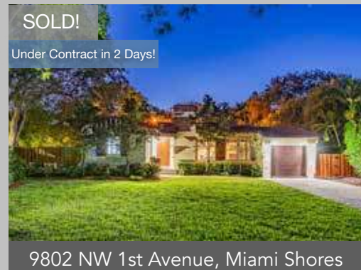
9802 NW 1st Avenue, Miami Shores Sold at $470,000