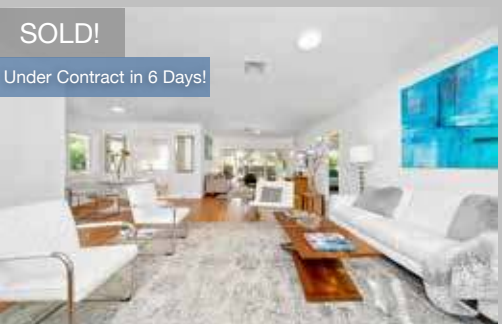
17 NE 107th Street, Miami Shores Sold at $585,000