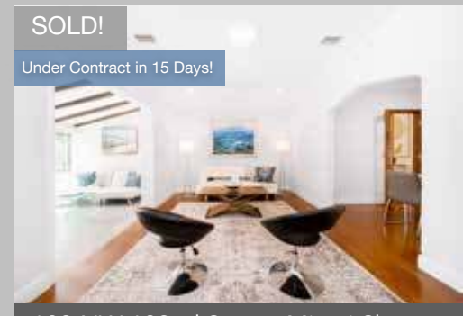
189 NW 102nd Street, Miami Shores Sold at $525,000