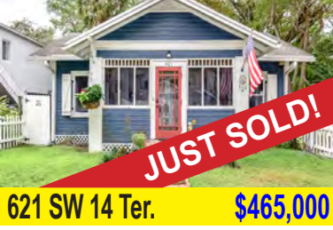
This adorable white picket fence cottage has been remodeled without losing its charm. Located in highly sought after Riverside.