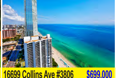
$699.000 | 16699 Collins Ave #3806

THIS GORGEOUSLY REMODELED HOME HAS IT ALL! This beautifully updated Miami Shores home features a fabulous floor plan and 3 Beds/2 Baths.