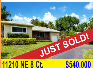
11210 NE 8 Ct.

Welcome to one of the most CHARMING homes in lush Biscayne Park! This custom MIMO masterpiece