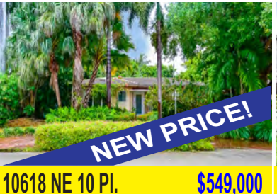
Welcome to the MOST DESIRABLE corner line at Incredible Value for this large 3BR/2BA open concept white kitchen and beautiful quartz countertops.

The Cricket Club! This 2BR/3BA Rotunda features a home that's perfect for entertaining with a brand new spacious floor plan, ALL impact windows.