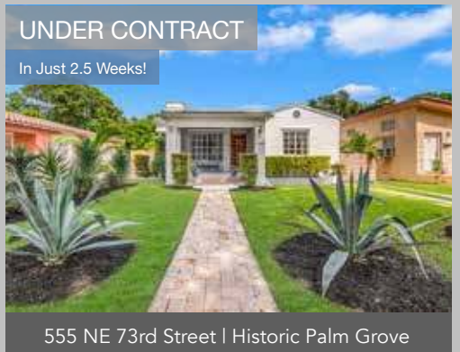
Listed @ $579,000