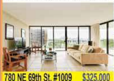
Skyline from this charming CORNER UNIT! This spacious 2 beds & 2 baths features a 30' wrap around balcony.

Rare to market, this pool home is located on a huge 36,111 st corner lot with a 2.758 sf main home that has 4 BD and 3 BA, plus a 658 sf 1/1 in-law suite for a total of 3,394 st of living space all on one level.