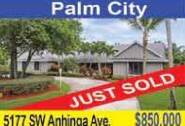
5177 SW Anhinga Ave.

Attention boaters and investors This original waterfront home is located on one of the finest streets on all of the Las Olas Islands.