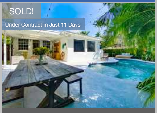
670 NE 73rd Street | Belle Meade Sold @ $824,000