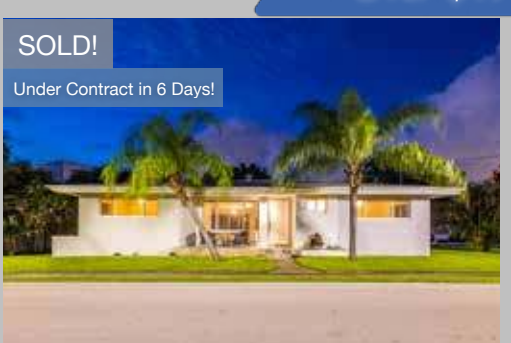
970 NE 87th Street | Shorecrest Sold @ $649,000