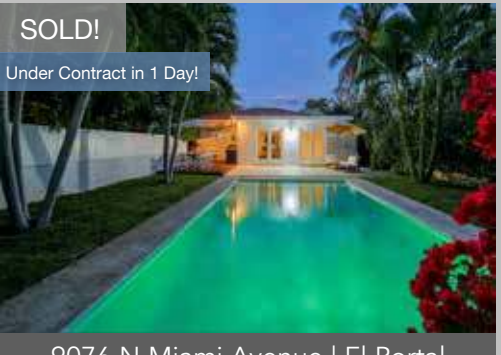
9076 N Miami Avenue | El Portal Sold at $550,000