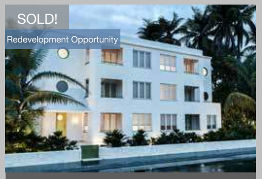
431 NE 62nd Street | Historic Palm Grove Sold @ $350,000