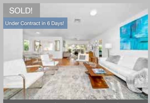
17 NE 107th Street | Miami Shores Sold at $585,000