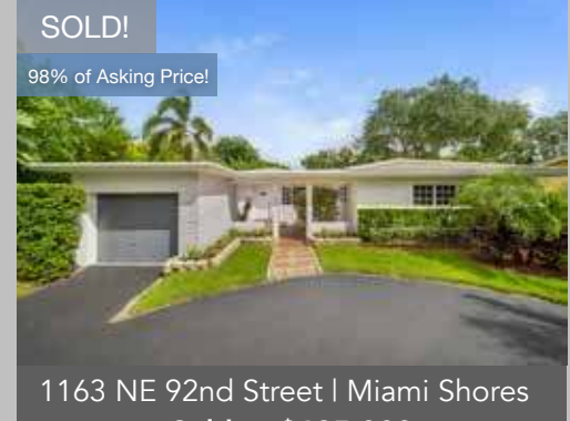
Sold at $685,000