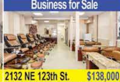
known full service nail Salon & Spa with repeat

Experience isn't Expensive...It is Priceless!