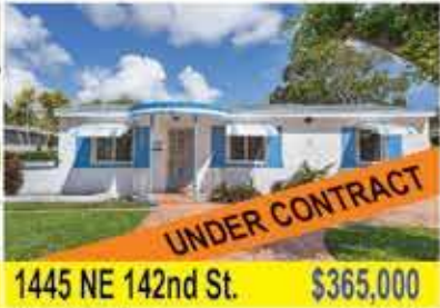
STUNNING VIEWS of the Bay and Downtown Miami. WELL-KEPT Ranch style home on a great block! With Welcome to the MOST DESIRABLE corner. almost 2,100 sq. ft under air, this 4 beds & 3 baths. Time at The Cricket Club! This 2 beds & 3 baths. property features a very spacious & open floor plan.