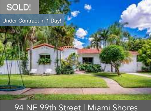
Sold at $779,000