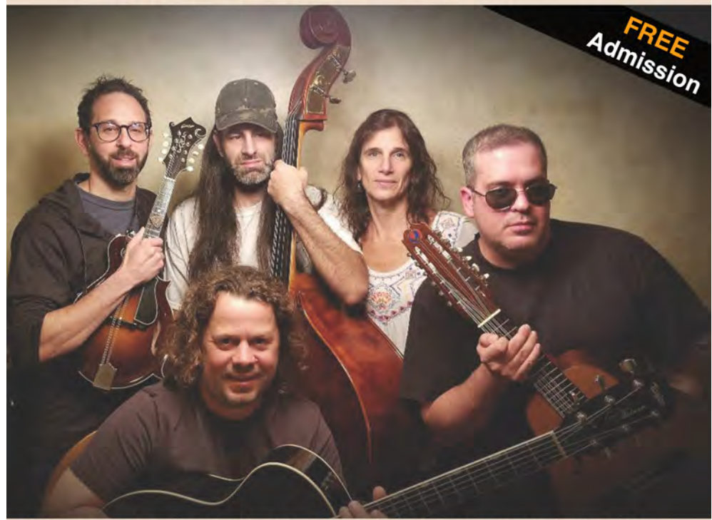
A tasty blend of non-GMO Americana String Music sprinkled with hints of Bluegrass and Gypsy Jazz.