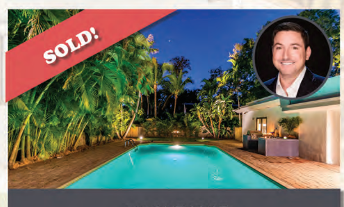
1116 NE 92 ST EAST SHORES POOL HOME