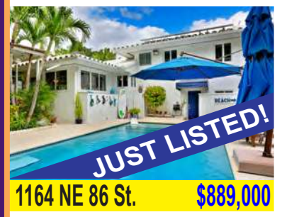
Imagine living in a home that is a COMPLETE RESORT! This magnificent 2 story masterpiece in Shorecrest features 4BR/3BA plus guest cottage.

Stunning 2 story home located in the desirable San Simeon Homes gated community. This 3 BR/2.5BA gem has been totally remodeled.