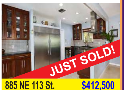
Beautiful Biscayne Park charmer! This totally remodeled 3BR/2BA home has a new barrel tile roof, all updated electrical, new baths & more.

Dripping in charm, this large 2 story pre-war old Spanish home is 1,981 sf with 3BR/2.5BA plus an attached garage.