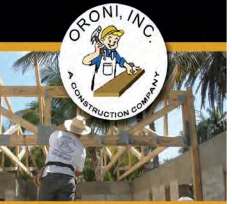
New Construction • Remodeling Residential • Commercial

Each month we publish photos of family pets. If you would like your pet featured please send in a photo, the pet's name, the name of the pet's family, and town of residence to "Pet of the Month" to: mgerstel@miamishores.com.