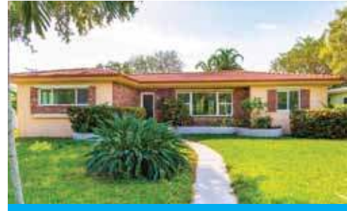
SOLD! Miami Shores $575,000