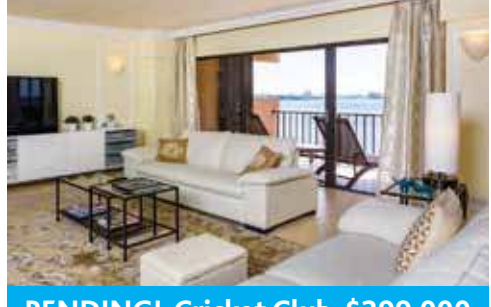
PENDING! Cricket Club $399,000