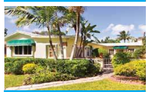
PENDING! El Portal $399,999