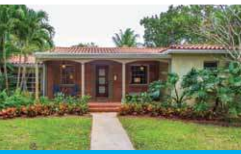
SOLD! Miami Shores $500,000