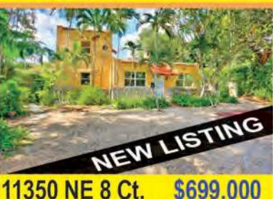
Welcome to the MOST CHARMING home in Biscayne Park! This 1920's Mission Style masterpiece has 4 beds & 3 baths (main house is a 4/2 & studio is 1/1 w/ separate entrance)