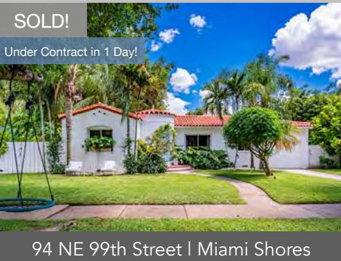
Sold at $779,000