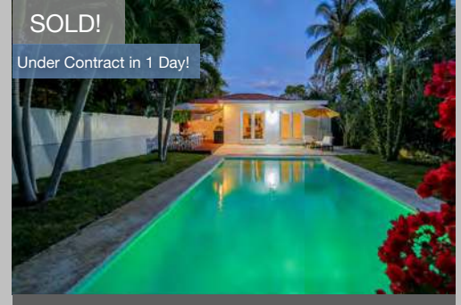
9076 N Miami Avenue | El Portal Sold at $550,000