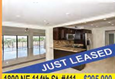
1800 NE 114th St. #411 $295,000

Successful turnkey restaurant located in busy shopping center. Seats 42. Large takeout business. Full kitchen. Gross $500K per year. 8 years left on lease.