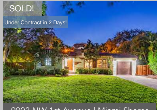
9802 NW 1st Avenue | Miami Shores Sold at $470,000