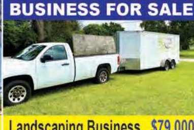
Landscaping Business $79,000

Amazing 2 bed/ 2 bath renovated corner unit with Charming and updated 2 story Townhouse in highly beautiful views of Biscayne Bay and city views. sought after, Northgate Community. This 2 bed & 2 1/2 bath unit features a spacious floor plan.