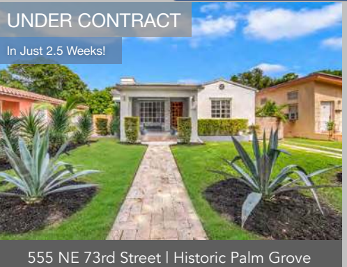
Listed @ 579,000