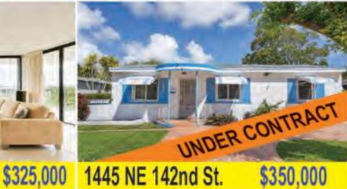
STUNNING VIEWS of the Bay and Downtown Miami WELL-KEPT Ranch style home on a great block! With Welcome to the MOST DESIRABLE corner Skyline from this charming CORNER UNIT! This spacious almost 2,100 sq. ft under air, this 4 beds & 3 baths line at The Cricket Club! This 2 beds & 3 baths property features a very spacious & open floor plan. Rotunda features a spacious floor plan.