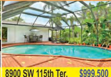
Rare to market, this pool home is located on a huge 36,111 sf corner lot with a 2,758 sf main home that has 4 BD and 3 BA, plus a 658 sf 1/1 in-law suite for a total of 3,394 sf of living space all on one level