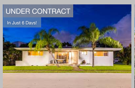
970 NE 87th Street | Shorecrest Listed @ $649,000

Over $15 Million in Sales in 2020 so far!