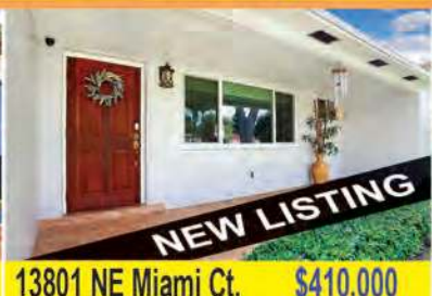
most charming homes in North Miami Beach! This 10,160 sq. ft. lot! This adorable Mid Century gem is a 2/2 in the main house & has a converted garage.

DRIPPING IN CHARM! Welcome to one of the Beautifully updated 3BD & 2BA home on a large adorable Mid Century gem has 4 beds and 2 baths.