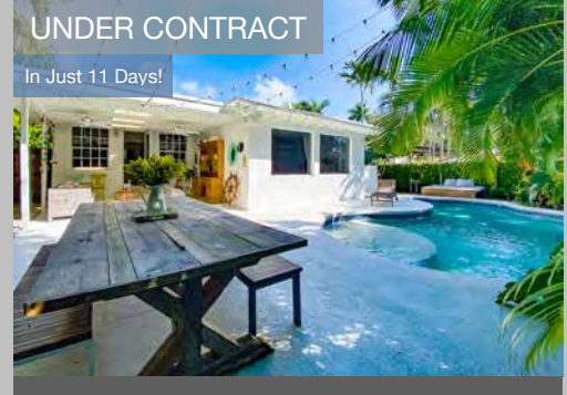
670 NE 73rd Street | Belle Meade Listed @ 839,000