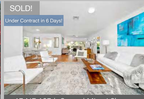
17 NE 107th Street | Miami Shores Sold at $585,000