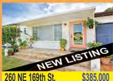
260 NE 169th St.

DRIPPING IN CHARM! Welcome to one of the Beautifully updated 3BD & 2BA home on a large adorable Mid Century gem has 4 beds and 2 baths.