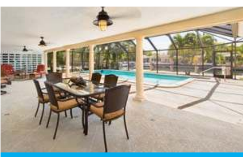
SOLD! Keystone Point $980,000