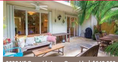
3038 NE Quayside Lane, Quayside | $649,000