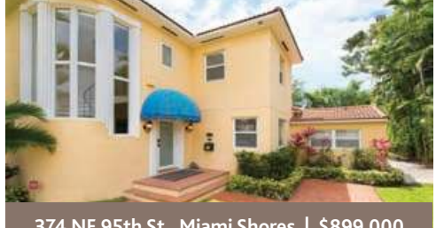
374 NE 95th St., Miami Shores | $899,000