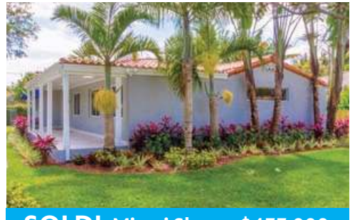
SOLD! Miami Shores $455,000