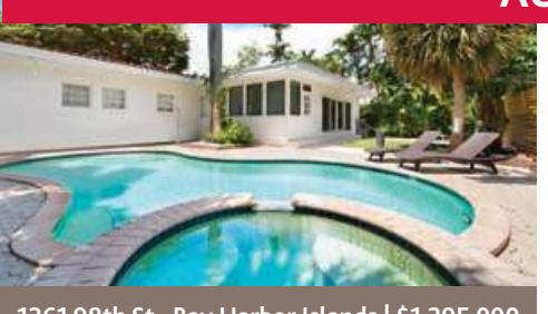
1361 98th St., Bay Harbor Islands | $1,395,000